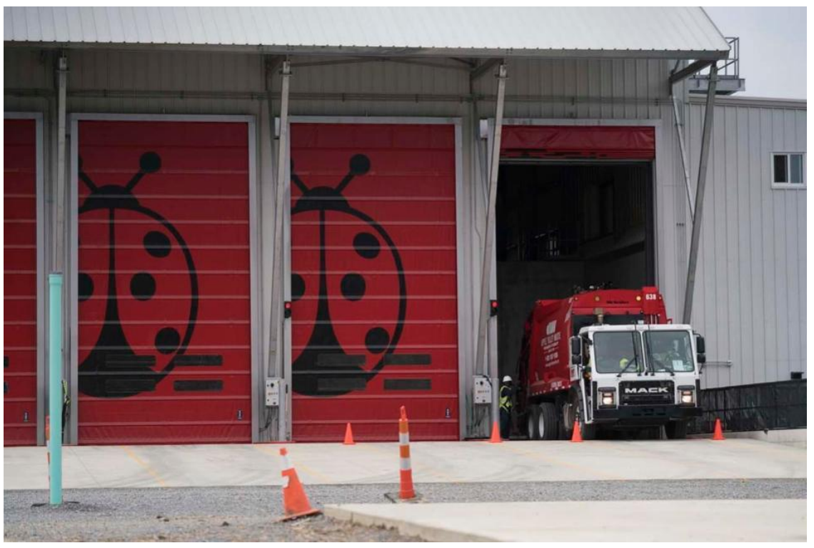
Entsorga uses a ladybug in its logo.

Burning coal to generate energy pollutes the air. Burying trash in landfills doesn't improve water quality, either. But what if you could turn trash into an alternative or supplement to coal? Entsorga says it has an answer, although testing is ongoing.